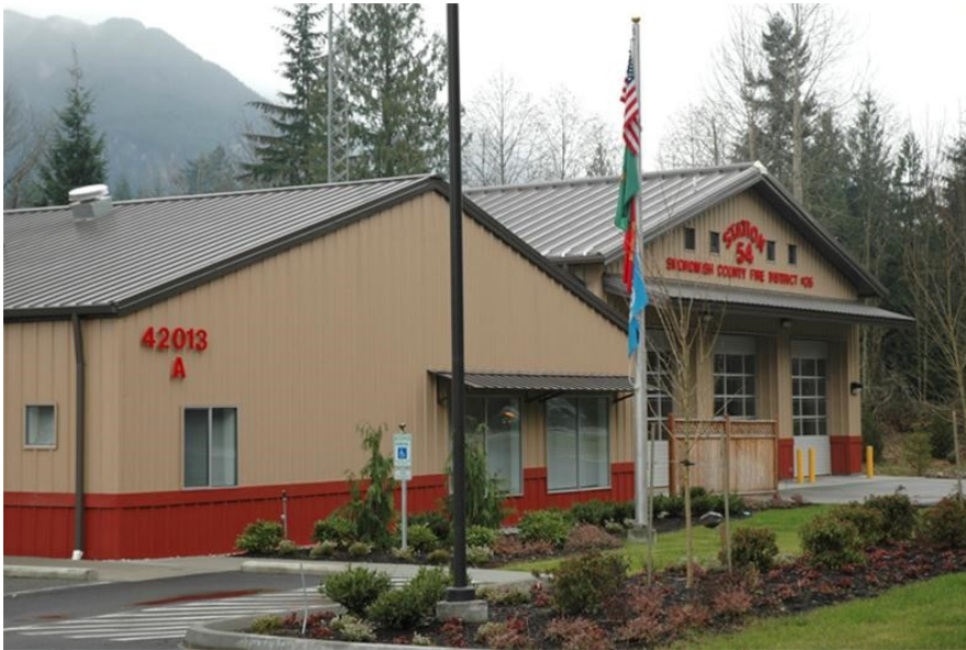
Station 54, on highway 2, Gold Bar.