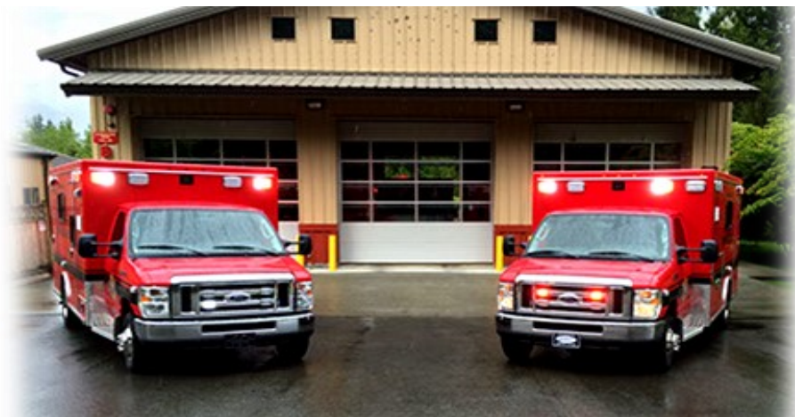
Our new Medic Units